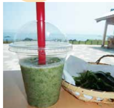
Seaweed smoothie 450 yen