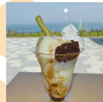
Japanese-style parfait topped with red bean paste 480 yen