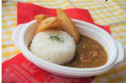
Curry rice for kids 550 yen