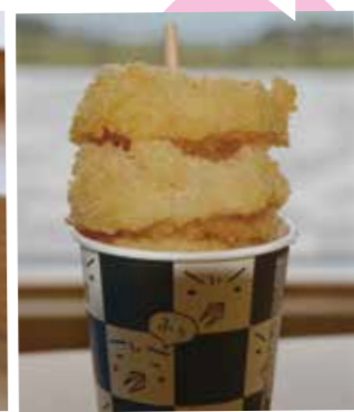
Onion ring 550 yen