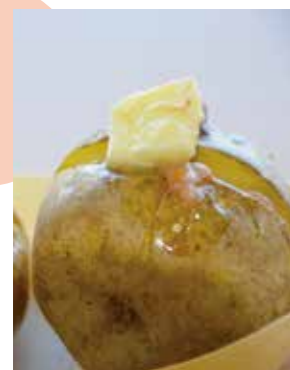
Baked potato topped with butter and shiokara 450 yen fermented fish product