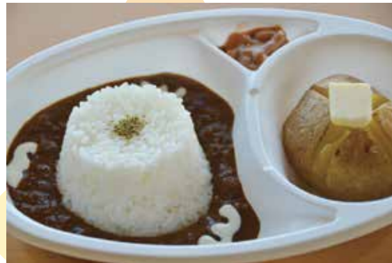
Original spicy Kabushima curry (served with baked potato) regular 750 yen large 850 yen