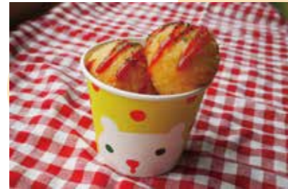
UmicaFE rice croquette 500 yen