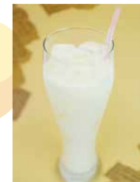
Minato no kiri 480 yen