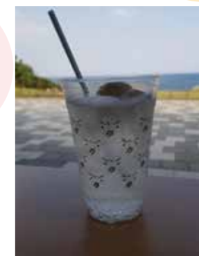
Shiraiwa 480 yen

local Mishima soda topped with vanilla ice cream