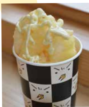
Mackerel fritter 450 yen