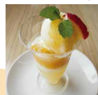
Ringo no shizuku apple-flavored jelly topped with vanilla ice cream and apple jam 480 yen