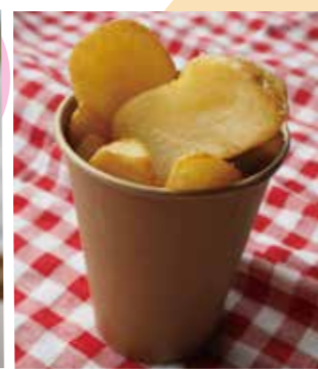
French fries 300 yen