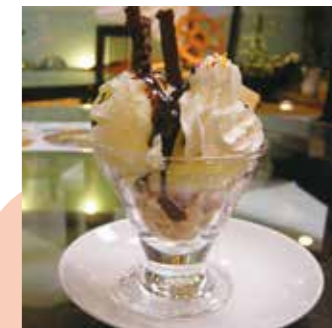
Chocolate parfait 480 yen