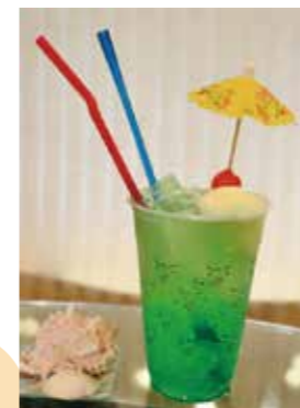
Tanesashi no shibafu 500 yen

melon-flavored soda topped with vanilla ice cream