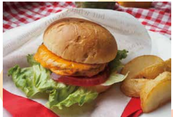
Cheese Barger with french fries 600 yen